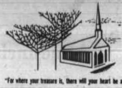
"For where your treasure is, there will your heart be also"